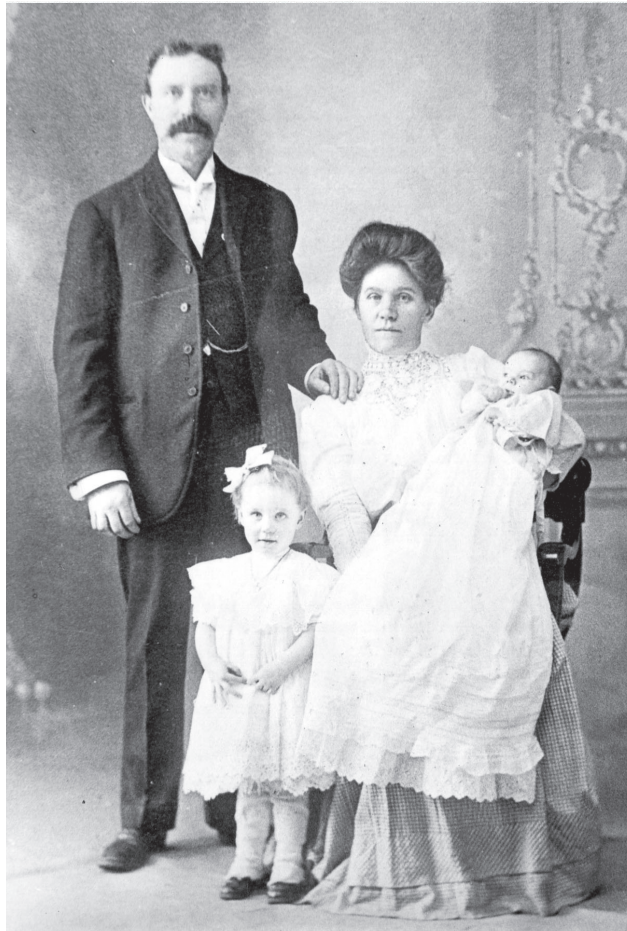
THE O'NEILL FAMILY