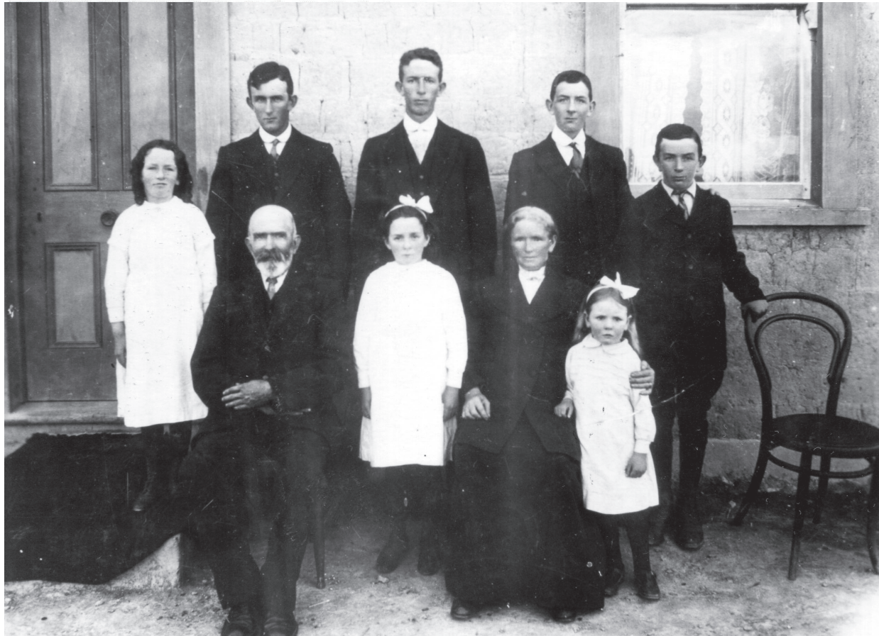
THE McERLANE FAMILY