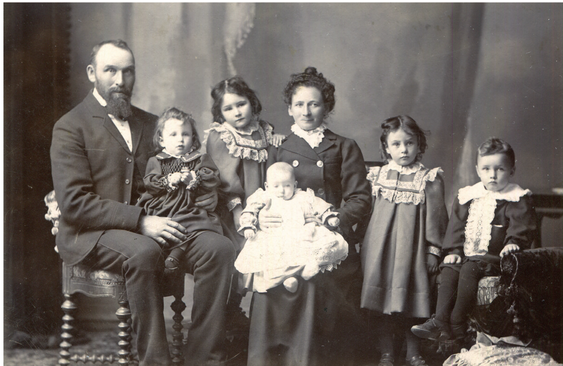
THE O'NEILL FAMILY