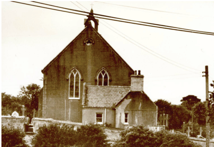
St Mary's Church, Greenlough, parish church of those above.